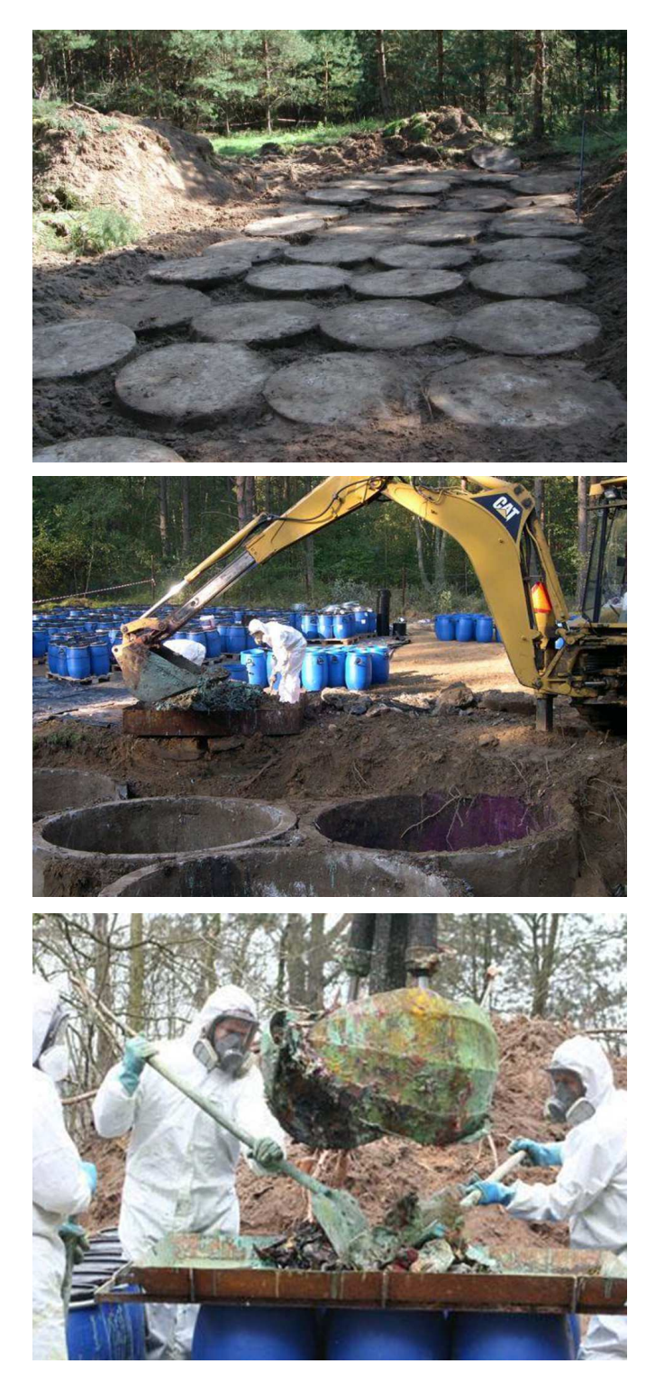
Fig. 1. Liquidation of burial grounds near the villages Tuchomie (Pomerania province)

reasons or the complicated legal situation of the land, were planned for liquidation at a later date. Not all of the archived pesticide tombs were found or such ones were found in reference of which there was nothing mentioned in the documentation. Pesticide tombs were situated in various locations, most often in the forests, meadows, wastelands, bunkers from World War II, concrete wells, underground pits, basements of military facilities (Gałuszka et al. 2011) – Fig. 1.