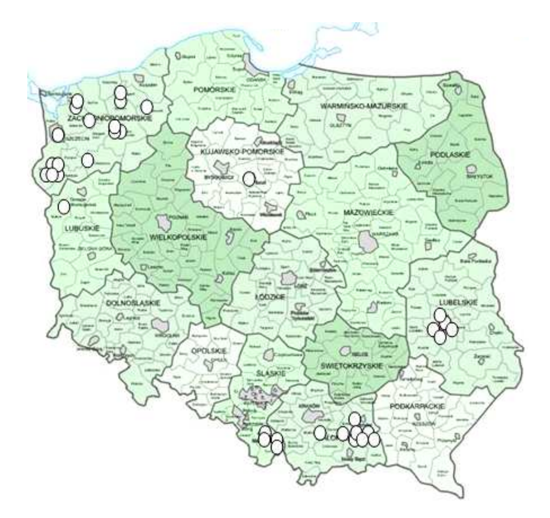
Fig. 1. The origin of honey samples bought in Western Pomeranian province Ryc. 1. Pochodzenie próbek miodu zakupionych w województwie zachodniopomorskim