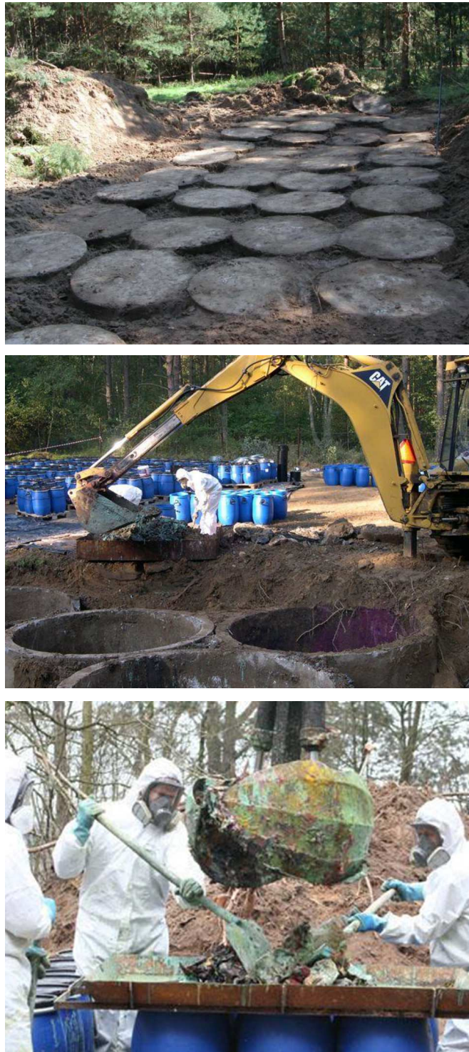
Fig. 1. Liquidation of burial grounds near the villages Tuchomie (Pomerania province)

reasons or the complicated legal situation of the land, were planned for liquidation at a later date. Not all of the archived pesticide tombs were found or such ones were found in reference of which there was nothing mentioned in the documentation. Pesticide tombs were situated in various locations, most often in the forests, meadows, wastelands, bunkers from World War II, concrete wells, underground pits, basements of military facilities (Gałuszka et al. 2011) – Fig. 1.